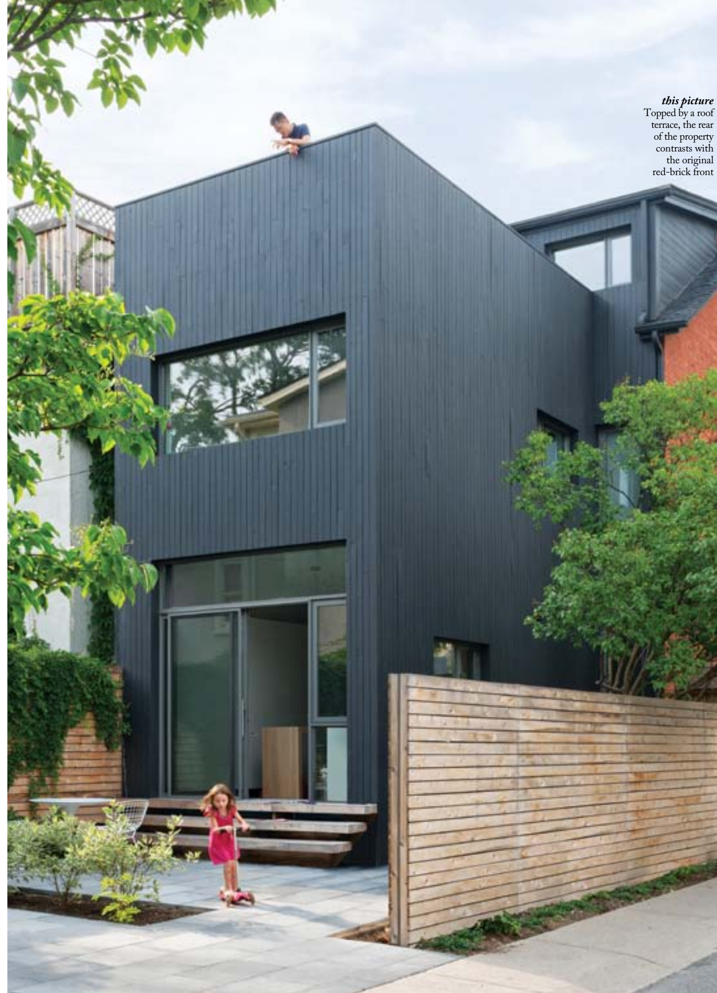
this picture Topped by a roof terrace, the rear of the property contrasts with the original red-brick front

Lounge chairs Klaus (+1 416 362 3434; klausn.com) Bed Avenue Road (+1 416 548 7788; avenue-road.com)