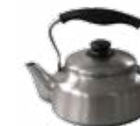
▲ Handcrafted steel Japanese kettle (H21xDiameter18cm), £86, Sori Yanagi at Labour and Wait (020 7729 6253; labourandwait.co.uk)