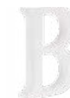
▲ Personal accessory Wooden letter in mango wood (H15xW6xD2cm), £5, Nkuku at Selfridges (0800 123 400; selfridges.com)