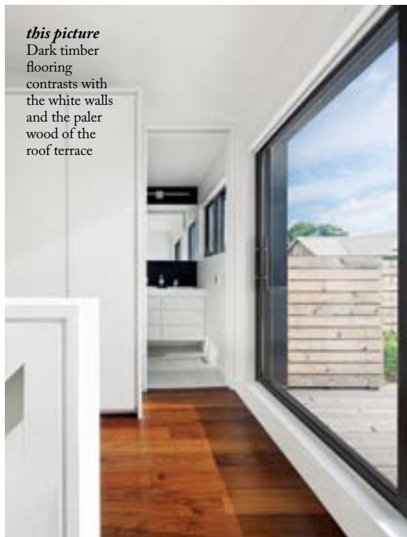
this picture Dark timber flooring contrasts with the white walls and the paler wood of the roof terrace

The resulting house is the perfect urban family home; its monochromatic interior that gives the illusion of more space inside is the perfect solution to the restrictions on adding floor space by extending. Now the house takes the best from its Victorian roots and mixes this with a contemporary element, providing the Sampsons with exactly the home they wanted for their family, as Dubbeldam explains: 'The new streamlined elements let the old features speak, while still having a voice and a character themselves. The contrasts within the house allow the light to shine through, giving life and energy to the building once more.' GD