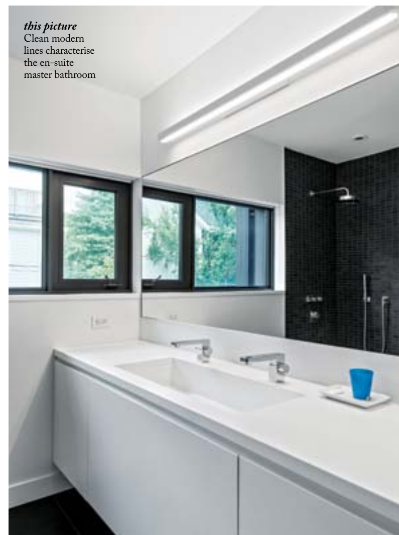
this picture Clean modern lines characterise the en-suite master bathroom