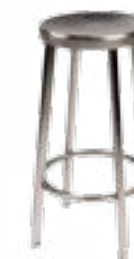
▲ High chair Carisma bar stool in brushed steel (H70xDiameter34cm), £124, Dan-Form at Wayfair (0800 169 0423; wayfair.co.uk)