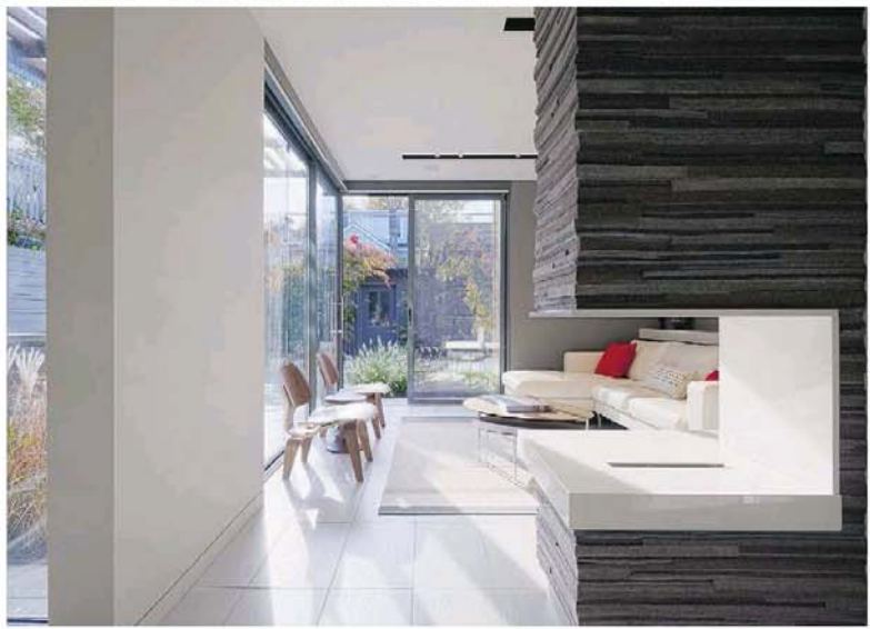
Clockwise from above: The back of the Through House, where the horizontal lines continue; the heritage façade, with modern door; a long interior view out to the yard.